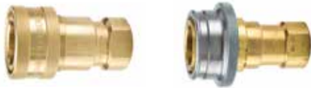
H3-68 has grip-ring sleeve